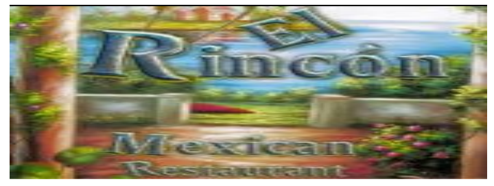
Come and enjoy some yummy Mexican food! Breakfast, Lunch, and Dinner

So if you are in need of some council or a good lawyer; call Rigby, Andrus & Rigby at 208-356-3633 or visit their website at <u>www.rex-law.com</u>