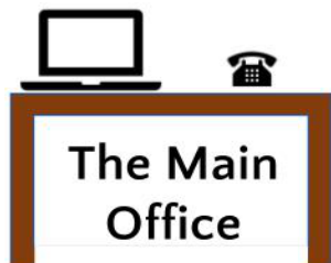
Office Space for rent in Ashton Desks, Utilities & Internet Included

Rent the conference room for your organization's meeting on Main Street! Contact Sara Bowersox at 208-652-3350 for more information.